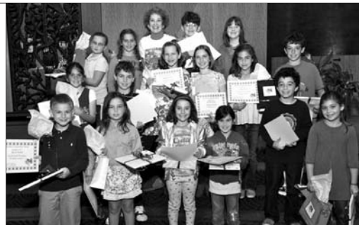
Winners of the 2009 Levine Library Reading Contest gain recognition at the Special Religious School Awards Assembly. From left to right they are:

Tuesday: 2:00 p.m. - 6:15 p.m. Thursday: 1:00 p.m. - 4:15 p.m. Sunday: 9:30 a.m. - 12:30 p.m.